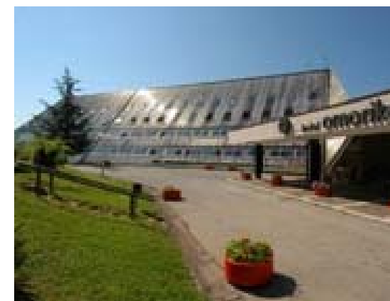
Hotel “Omorika”, Tara Mountain